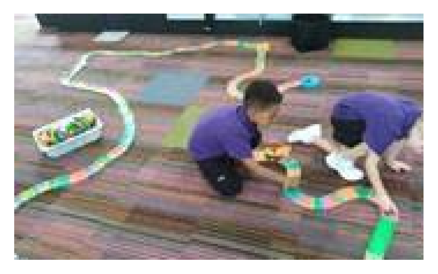
Facebook HUB page