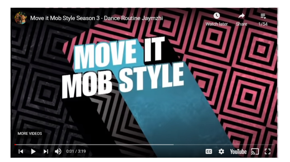
For more Move It Mob Style visit their website https://moveitmobstyle.com.au/